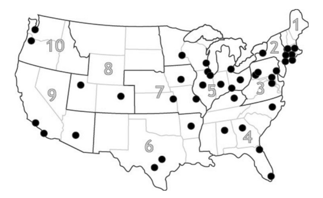
FIGURE 2. Map of injury free member program sites by American College of Surgeons U.S. Trauma Regions. There are 40 member sites covering the 10 national trauma regions which are based on divisions of the U.S. Federal health regions.

adolescents. Because injury prevention crosses boundaries of responsibilities, community coalitions are an essential component of prevention efforts aimed at impacting intentional and unintentional injury mechanisms that cannot be effectively addressed by the public health community alone.